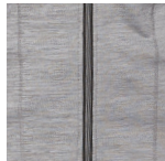
096 Medium Grey Heather