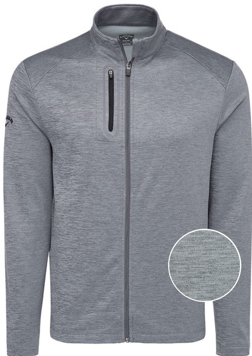
002 Black / Quiet Shade