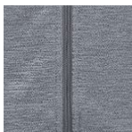
096 Medium Grey Heather