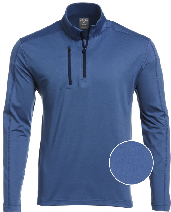
426 Coastal Fjord

† Sizes are based on your actual nude body measurements.